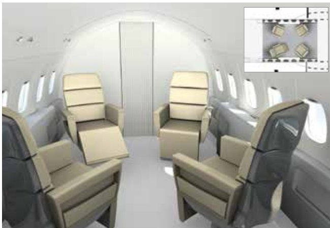
Lounging, meeting, working and sleeping – just four applications of chair™ for greater comfort on board.