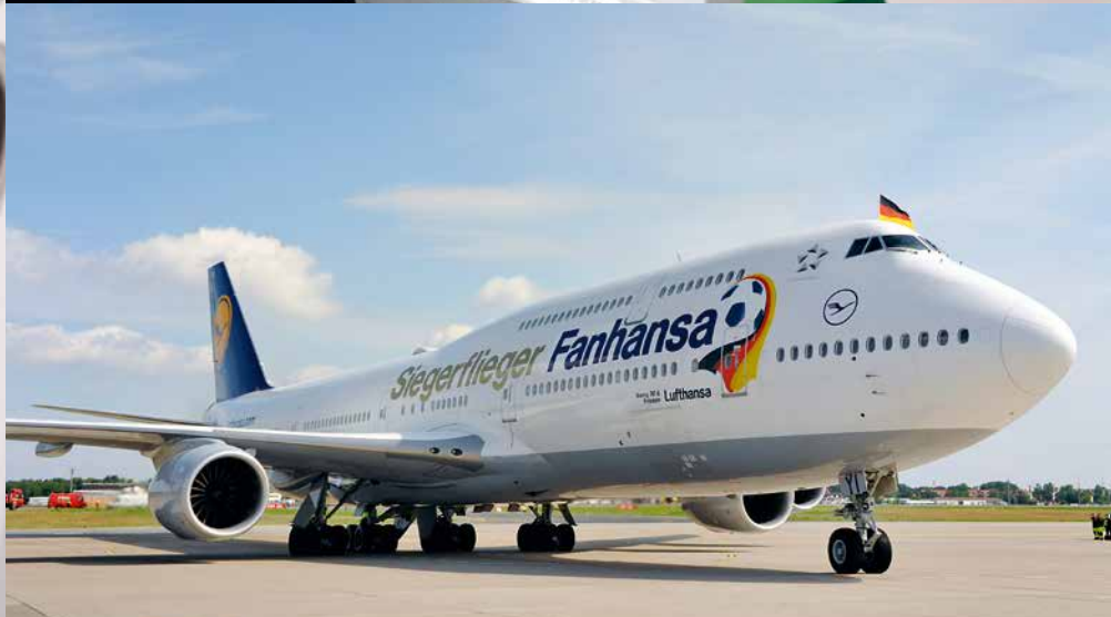
The extremely fast and cost-efficient application of exterior foils makes the decoration of aircraft for short-term use a viable option.