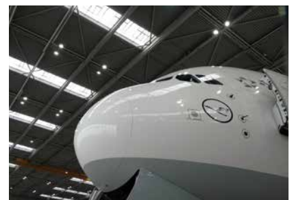
Lufthansa Aircraft – example of painted aircraft