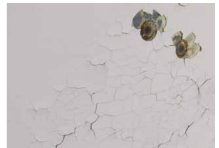
Paint cracks on composite structure