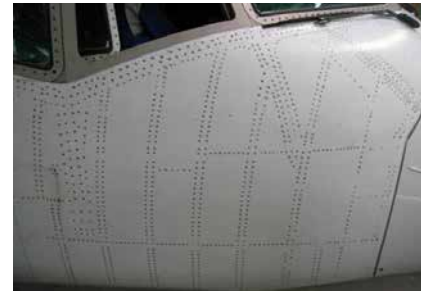
Rivet rash deterioration of an aircraft painting

With its comprehensive know-how in aviation painting and high technology laboratory equipment available, the expert team of Lufthansa Technik Central Laboratory Services is able to perform in-depth failure investigations. For an overview of the destructive and non-destructive investigation methods as well as of Lufthansa Technik's mobile and stationary testing capabilities please turn to the back page.