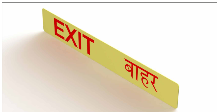
One of many exit sign design variations.

GuideU has become the standard for all commercial aircraft. GuideU 1000-Series is factory-fitted by Airbus, Boeing and Bombardier. Retrofit installations are covered by Lufthansa Technik supplemental type certificates (STC) available for most commercial aircraft.